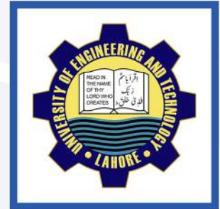
UET Lahore, Pakistan