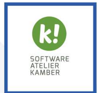
Software Atelier Kamber, Switzerland