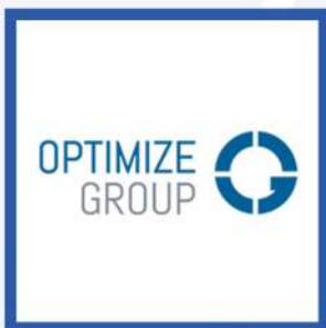
Optimize Services BVBA, Belgium