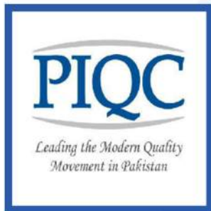
PIQC Institute of Quality, Pakistan